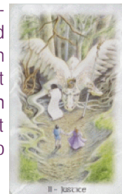
Justice from the Celtic Dragon Tarot