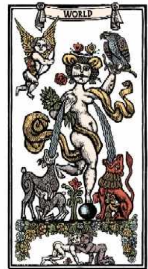
"The World from an as-yet untitled tarot based on the work of Zdenek Mezl"

"Scans provided courtesy of The Tarot Garden" http:// www.tarotgarden.com