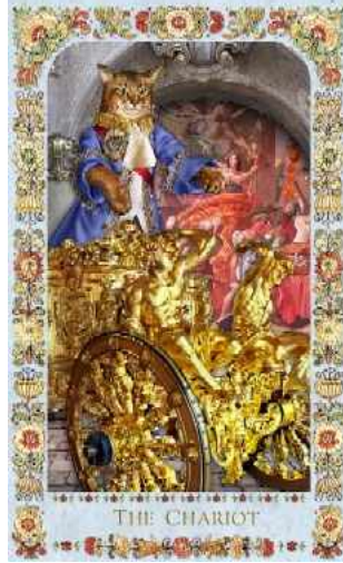
"The Chariot from the Baroque Bohemian Cats' Tarot"

Don't forget your Deck and Book Check out http://www.tarotforlife.com/FirstDeck.html For some good 1st deck info