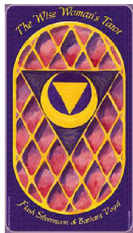
Wise Woman's card back